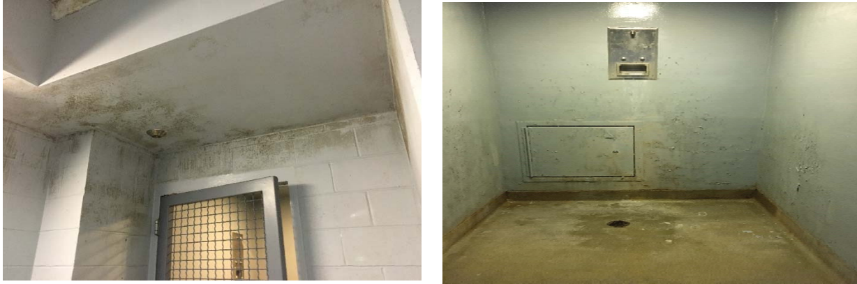
Figure 5. Hallway leading to shower filled with mold and shower stall with mold, mildew, and peeling paint. Observed by OIG at the Essex Facility on July 24, 2018.

dormitories and all seven detainee housing units, shower stalls 8 were unsanitary as evidenced by mildew, mold, and peeling paint. Mold in the showers extended into the hallways leading to the showers (see figure 5).