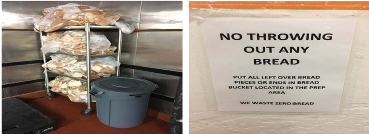
Figure 3. Undated moldy bread held in the refrigeration unit for indefinite periods. Signage posted in the kitchen to direct staff not to discard any bread. Observed by OIG at the Essex Facility on July 24, 2018.

can cause allergic reactions and respiratory problems, and some molds, in the right conditions, can produce poisonous substances that can cause illnesses.