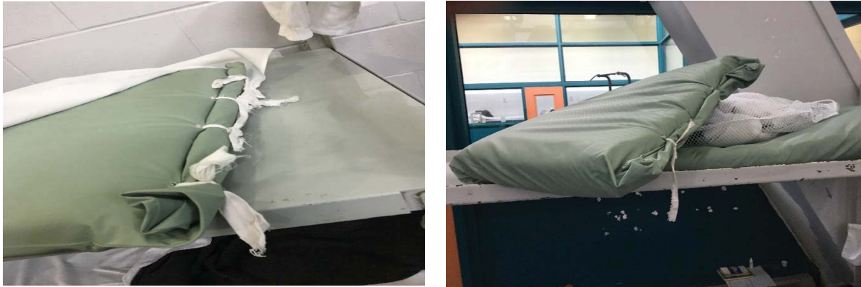
Figure 6. Detainee mattresses being held together with tied sheets. Observed by OIG at the Essex Facility on July 24, 2018.

ICE standards 10 require that all detainees be allowed outdoor recreation time outside their living area. However, the Essex Facility lacks outdoor space, and recreation for detainees was located within housing units. We observed large glass enclosures inside detainee living areas with mesh cages at the top to allow in outside air (see figure 7). Facility staff indicated that ICE was going to build a soccer field for outdoor recreation when the facility began housing detainees in 2010, but ICE never completed the project. ICE records indicate discussions had taken place regarding outdoor recreation, but no agreements were made between ICE and the facility. Based on our review of the contract and ICE inspection records, ICE officials have never documented concerns regarding outdoor recreation in their weekly inspections or cited the facility for failure to meet this detention standard since it began housing detainees.