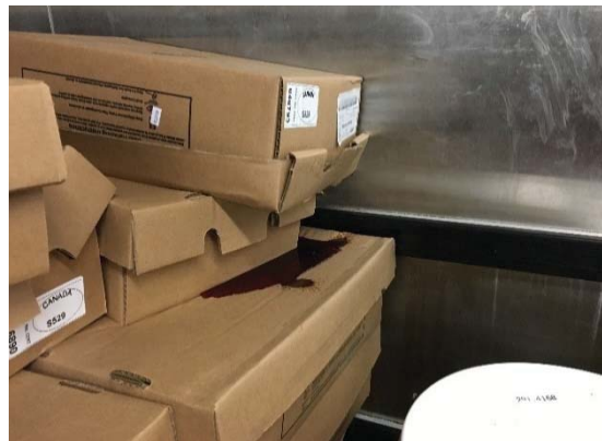
Figure 1. Refrigerator with blood leaking from open boxes containing raw chicken. Observed by the Office of Inspector General (OIG) at the Essex Facility on July 24, 2018.

Detainees also reported being repeatedly served meat that smelled and tasted bad. During dinner service, we observed facility staff serving detainees hamburgers that were foul smelling and unrecognizable (see figure 2).