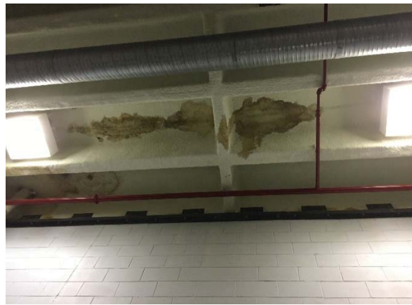
Figure 4. Roof leaks found in every housing unit.

Observed by OIG at the Essex Facility on July 24, 2018.