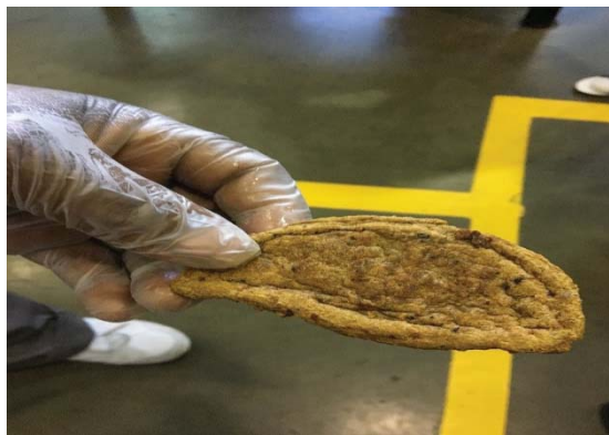
Figure 2. Slimy and discolored lunch meat stored without any labels (at left). Hamburger patty served to detainees that was foul smelling and unrecognizable (at right). Observed by OIG at the Essex Facility on July 24, 2018.

In addition, we observed expired and moldy bread in the facility refrigerator despite U.S. Department of Agriculture guidance 6 to discard bread with mold. Kitchen staff reported placing all unused bread from food service into large trash bags and trash cans to be used for making bread pudding once every 2–3 weeks. Furthermore, kitchen management posted a sign prohibiting the disposal of any bread (see figure 3). According to the U.S. Department of Agriculture, such practices put the health of staff and detainees at risk as mold